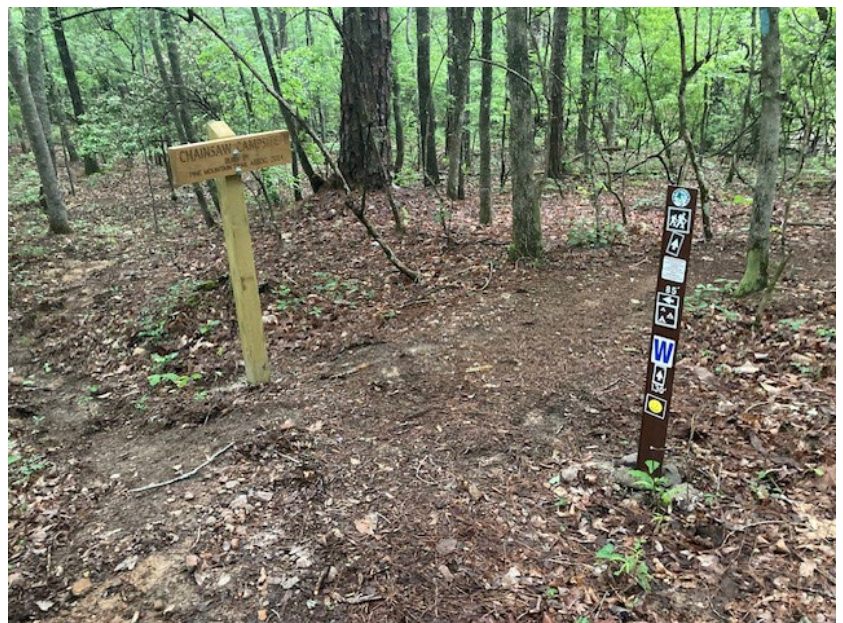
Looking east as you approach the site.