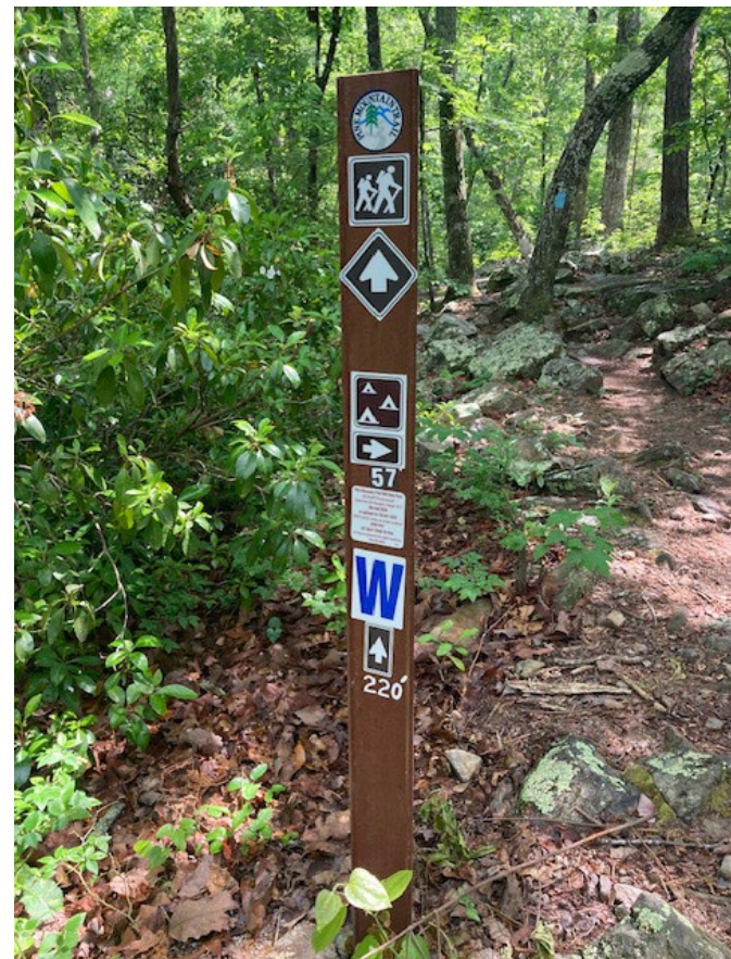
Looking east. Note: 220' to water