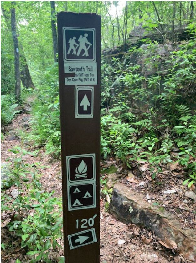
This is looking west at campsite entrance