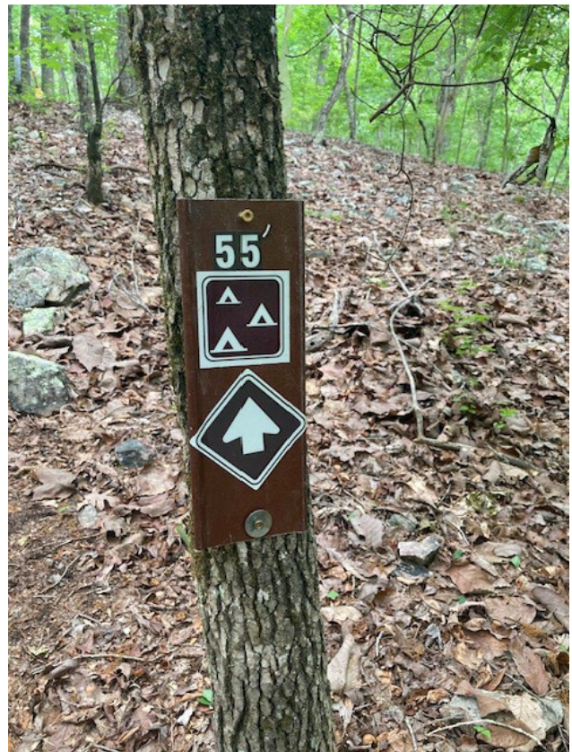
Just uphill from trail 65' you see this directional sign